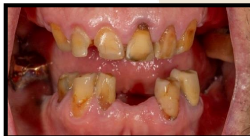
Front Teeth Apart