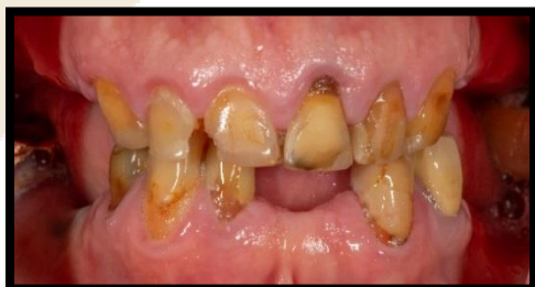
Front Teeth Together